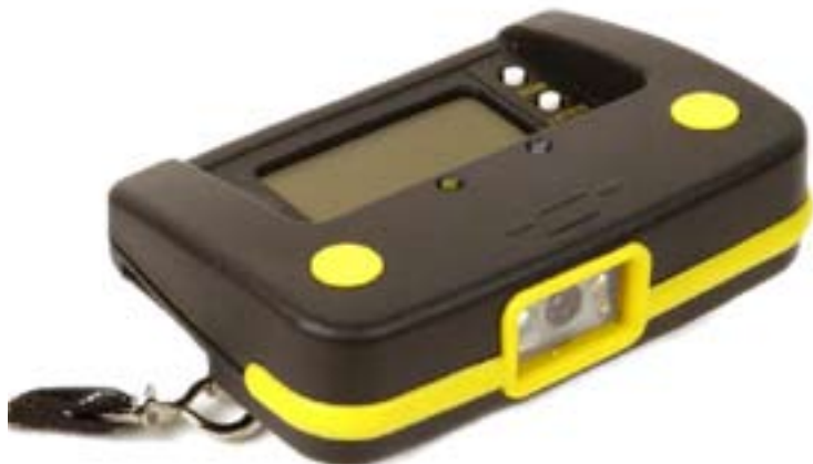
Actual Size: 4.25" x 3" x 1.25"